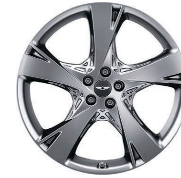
22" MEDIUM SPUTTERING