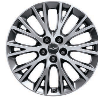
19" MEDIUM METALLIC GRAY