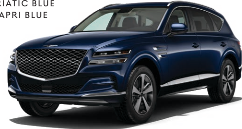
ADRIATIC BLUE & CAPRI BLUE