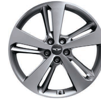
20" MEDIUM METALLIC GRAY