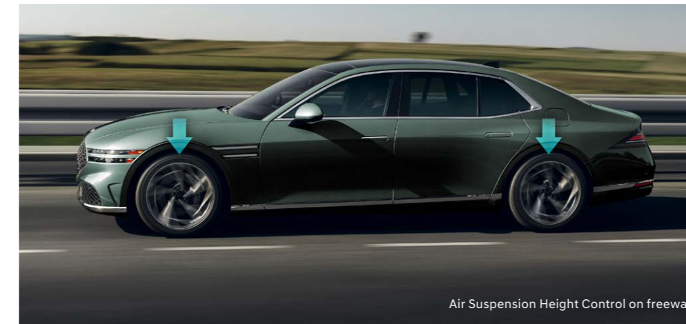
Air Suspension Height Control on freeway