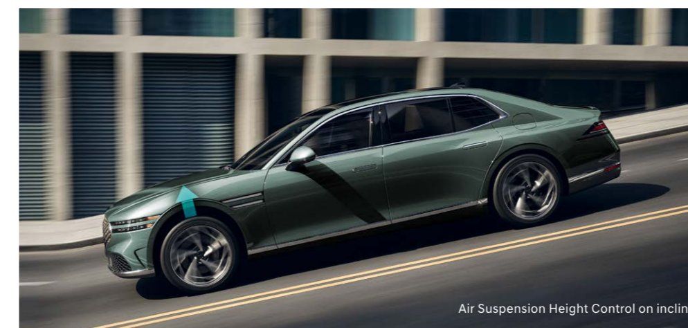
Air Suspension Height Control on incline