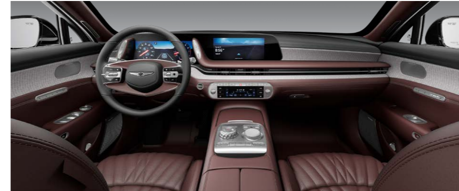
OBSIDIAN BLACK & BORDEAUX BROWN