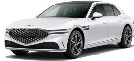
VERBIER WHITE MATTE