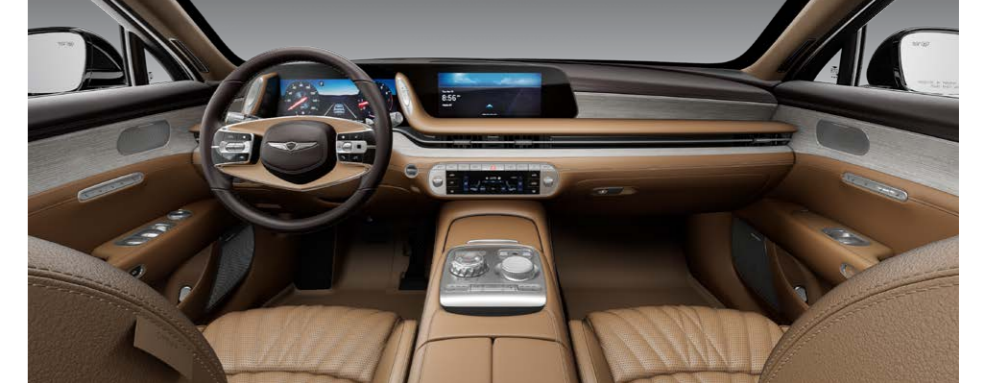
VELVET BURGUNDY & DUNE BEIGE